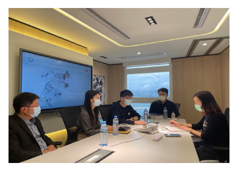
HKUTTO arrranged media interview for Hong Kong Universal Intelligent Technology Limited.

New technology that combines machine learning with computer vision can now be used in swimming pools to save drowning victims. The technology can also be used to enhance training for swimmers, golfers and yoga practitioners.